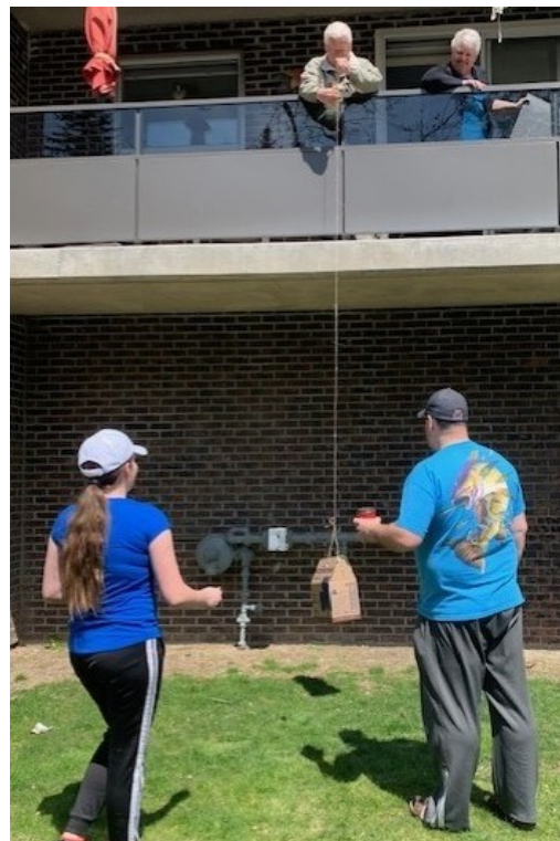
Social Distancing deliveries!